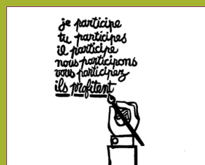
FIGURE 1 French Student Poster. In English, I participate; you participate; he participates; we participate; you participate ... They profit.